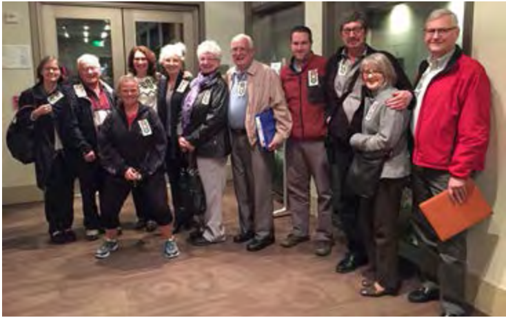
Supporters of the traffic signals on Reliez Station Road gathered at a Lafayette City Council meeting.

Who knew there would be so much controversy in the name of safety over a pair of traffic signals on Reliez Station Road?